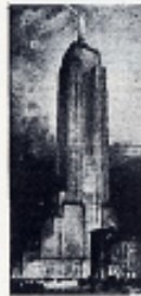
FIG. 1—EMPIRE STATE BUILD- ING, NEW YORK CITY

Empire State Building in New York City Involving 57,000 Tons Goes Up in Record Time—Nine Derricks Starting Work on 425x198-Ft. Site Reduced to Five Above Twentieth Floor—Relay Platforms Necessary in Hoisting Steel—All Hoists Inside of Building