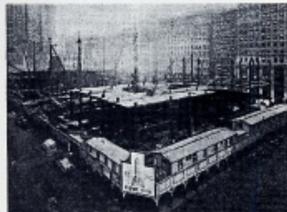
FIG. 2—EARLY ERECTION VIEW OF EMPIRE STATE BUILDING

The erection plant is divided into two main parts—