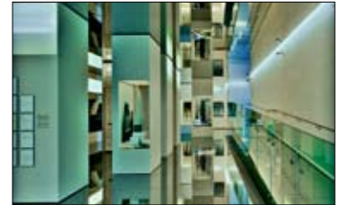
The Skyscraper Museum

Visit The Skyscraper Museum and its gallery for resources and hands-on activities about architecture and cities. Exhibitions showcase objects to support your instruction. These include scale models, floor plans, aerial maps, video footage, historic photographs and images of buildings, construction sites, and city landscapes.